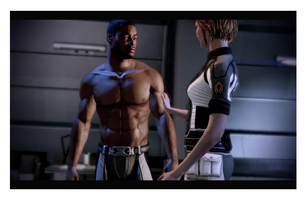
Figure 1 : Jacob and FemShep during their love-making scene in Mass Effect 21

The character of Jacob Taylor (Fig. 1), a possible love interest for a Female Shepard in Mass Effect 2 (ME2) is a black male soldier from the criminal organization Cerberus<sup>6</sup>. He deviates from a performance of black masculinity in games of "talking trash and crushing bodies with sheer force" as he is an eloquent, studied character (Leonard 2005, n.p). Jacob is, however, one of the two male characters objectified by female characters in the game for his perfectly shaped body.